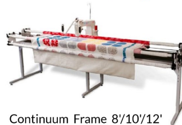
Continuum Frame 8'/10'/12'

Specializing in Sales & Service of Sewing, Sergers/Overlockers, Cover-stitch, Multi-needle Embroidery, Longarm Quilting Machines, Sewing Room Furniture, Glide Threads & Accs.