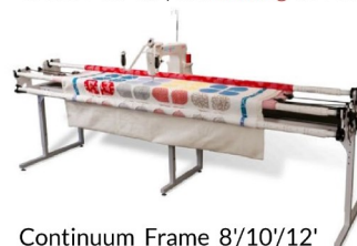
Continuum Frame 8'/10'/12'

Specializing in Sales & Service of Sewing, Sergers/Overlockers, Cover-stitch, Multi-needle Embroidery, Longarm Quilting Machines, Sewing Room Furniture, Glide Threads & Accs.