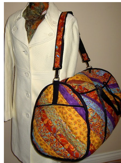
Colourplay Weekender Bag Wednesday, October 10, 2012