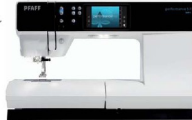
Pfaff Performance 5.0

$150 manufacturer's rebate available until December 26