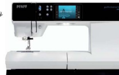
Pfaff Performance 5.0

$150 manufacturer's rebate available until December 26